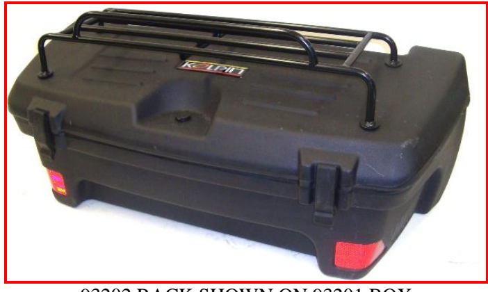
93202 RACK SHOWN ON 93201 BOX